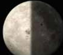
Last Quarter/Waning Moon