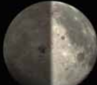
First Quarter/Waxing Moon